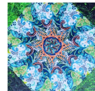
Fig. 1 Make 4 ↑

Step 4: Borders —For all borders, first measure down the middle of the quilt, use this measurement to cut side borders, sew side borders on, then measure across the middle of the quilt to get measurement to top & bottom borders, do this for each border. For first border, cut 3 strips at 1.5" x wof. Second border cut 4 strips at 2" x wof and for third border cut 4 strips at 3" x wof. Using your measurements, add borders one at a time.